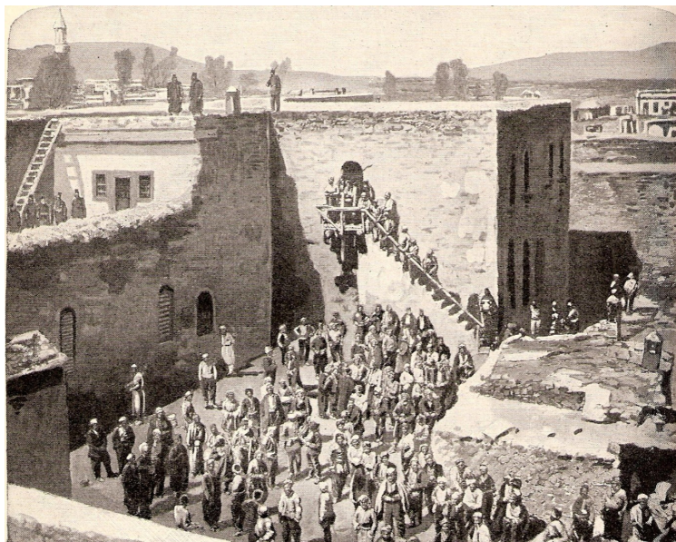
ARMENIANS HELD PRISONERS AFTER THE TREBIZOND MASSACRE.

For hymns, see our website: https://www.fmeorg.au/armenian-genocide