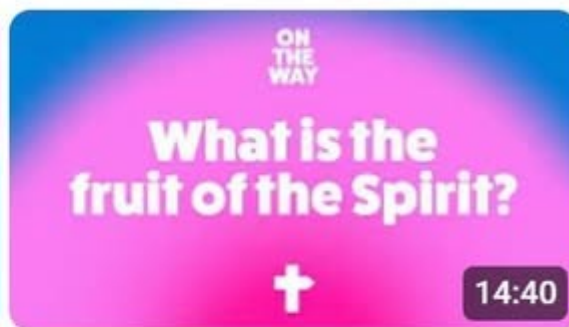
What Is The Fruit Of The Spirit?