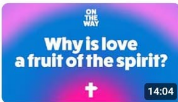
Why Is Love A Fruit Of The Spirit?